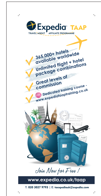
Gazebo, flags, pop up banners