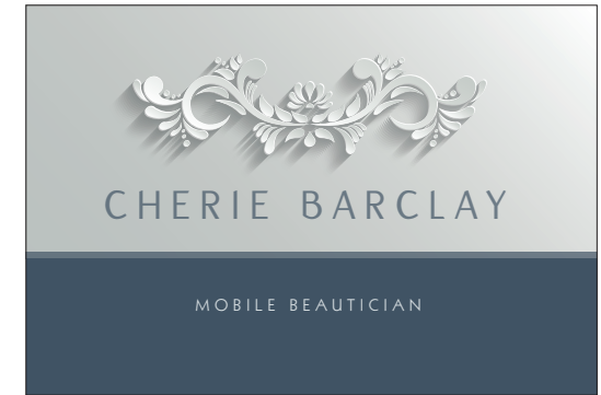
Beautician - Chelmsford Essex