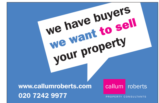
Property - London