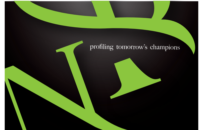
Recruitment Software - based in Chelmsford Essex