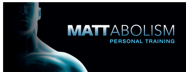
Physical Health - based in Shenfield