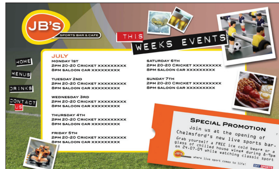
Bars, Pubs & Restaurants